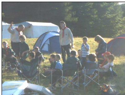
Shepley Scouts Camping Trip

A record of £48,132 has been awarded in grants. Examples of some of the projects supported are shown in the photos.