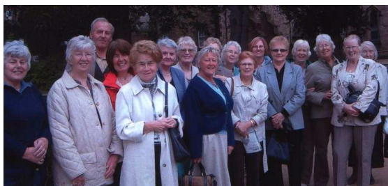
Stocksmoor WI's Trip to Wentworth

The Councillors and staff take their roles very seriously, and have worked hard to help their communities. Many were involved in planting the beautiful daffodils and autumn crocus. Hanging baskets and Christmas trees were also distributed throughout the area. The baskets were extended to cover Stocksmoor this year.