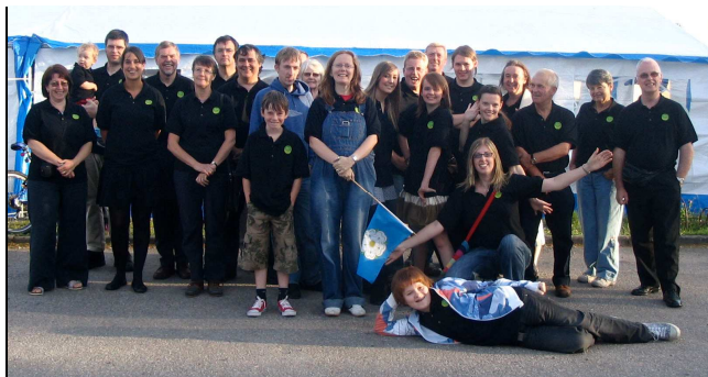
Shepley Band in Vackelsang

Councillors were heartened by the responses to the Kirklees Review into Parish Councils and found out that our efforts at the Parish Council are appreciated and valued by the majority of the public.