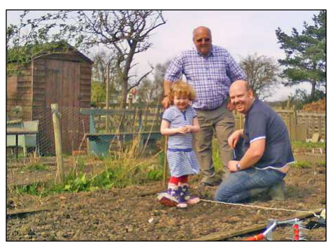
Work starts at Grange Moor allotments

As there is still considerable public demand for allotments, the Council has upgraded those in Grange Moor where new plots are currently being let and also carried out improvements at Shepley allotments. We are currently investigating the possibility of leasing an additional piece of land in the Parish as well as working with Kirklees to identify further sites. If you know of any, do let us know and we'll look into them.