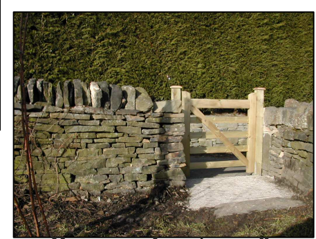
New gate and repair to wall at Shepley allotments