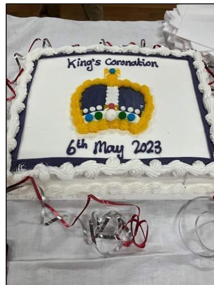
Top: Planting by Lepton Village Preservation Society and the Coronation Party at the Friday Friendship Café.