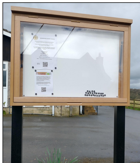
Improvements at St Lucius' Churchyard and the new noticeboard at Stocksmoor.