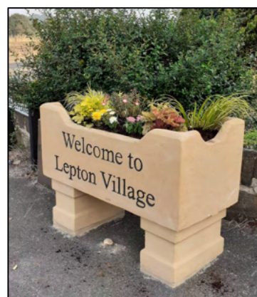
L-R: Fruit Tree Pruning Workshop in Kirkheaton; BEG puts the flail machine to good use; Planter organised by Lepton Preservation Society.