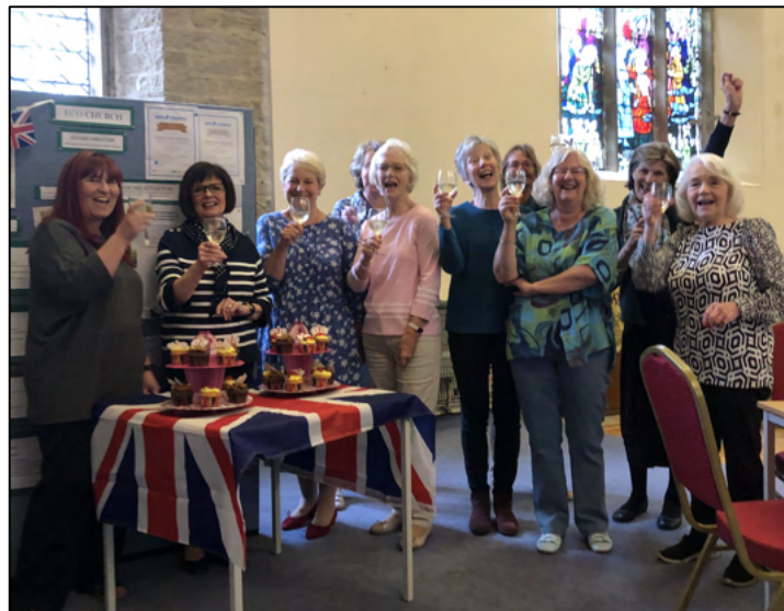
Hearts made by Flockton WI and Farnley Tyas WI Birthday celebrations.