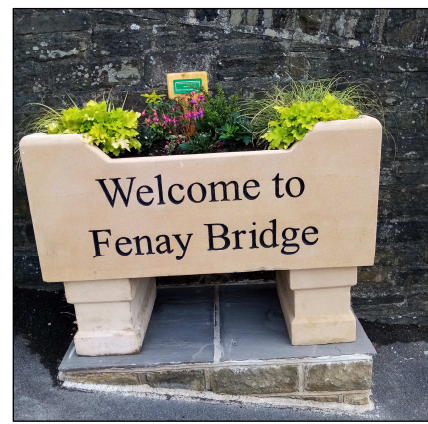
Left to right: BEG members installing a new handrail at Burton Dean Park, All Hallows Church in Kirkburton and one of the new village marker stones installed in Lepton & Fenay Bridge by the Lepton Preservation Society.