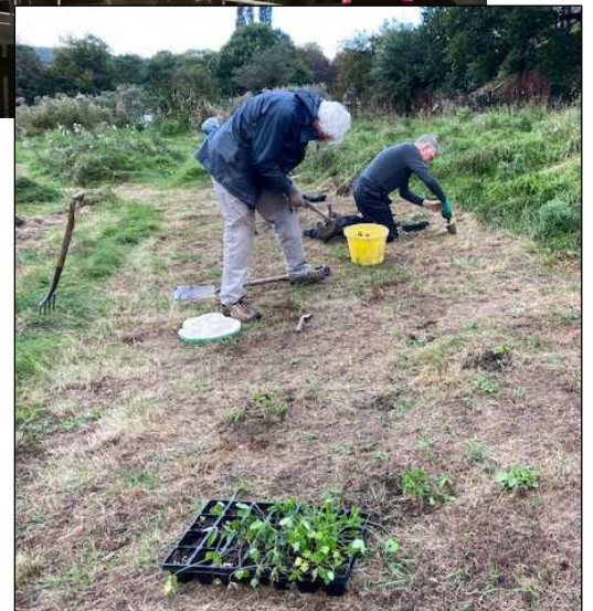
Clockwise from the top: Opening of Shelley Recreation Ground, Highburton Playgroup Sensory Garden, new replacement Christmas lights at Lepton Square, Members of BEG planting wildflowers, Kirkburton stocks in their new location courtesy of Kirkburton History Group and Shepley Playgroup's new fence.