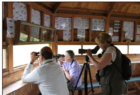
Photos: New bin courtesy of Farnley Tyas Community Group, 10 new Village Marker stone by Stocksmoor Village Association and members of the Shepley Bird & Wildlife Group in action.